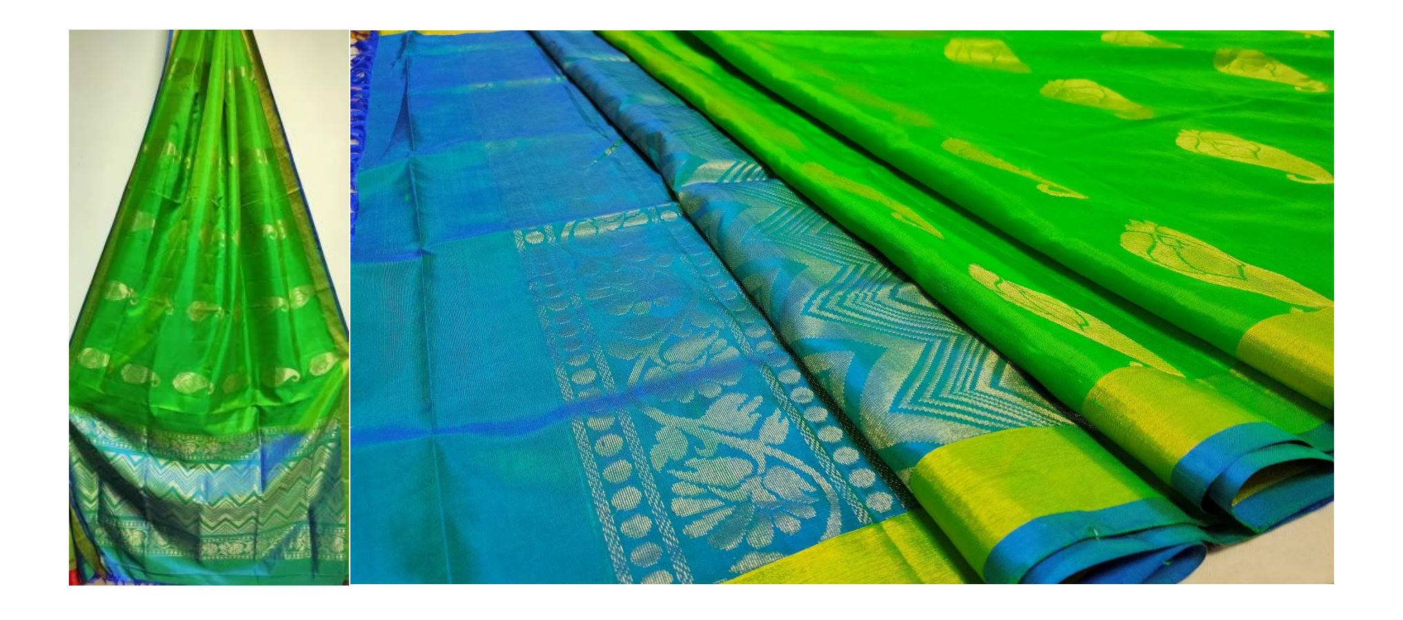
24. Salem Silk Saree

The Covai Silk Saree is also known as Soft Silk Sarees which are woven in Coimbatore, Tiruppur and Erode districts of Tamilnadu. In this Saree, instead of gum, plain water is applied and rubbed thoroughly by the weaver to get the soft handle with improved lustre on the Saree. These Sarees are woven with large floral contemporary designs with fancy colors. As the name implies, theseSarees are very soft and light in weight which makes the wearer feel comfortable.