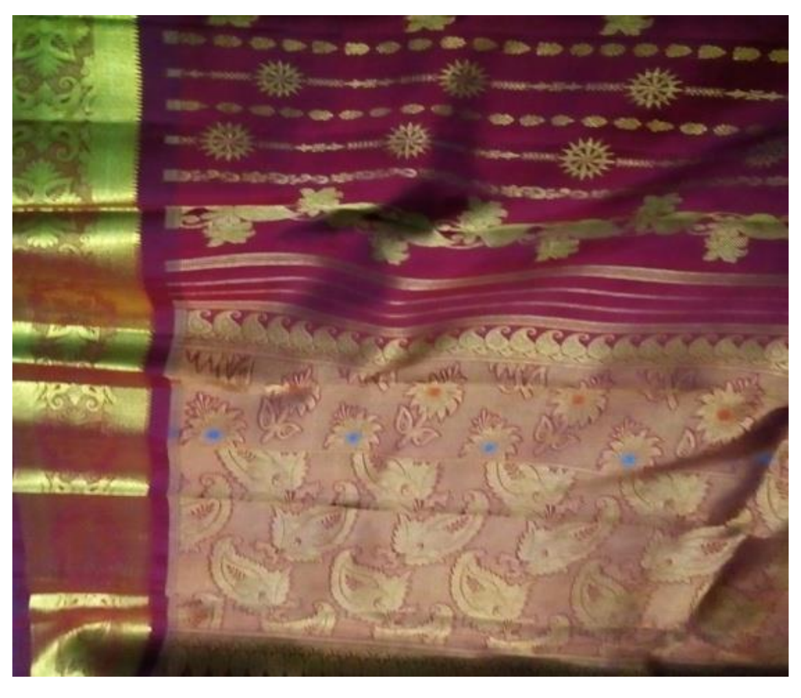
35. Thirubuvanam Silk Saree

It is exclusive pure silk Saree having designs on border, body and pallu with pure gold Zari. Rich colours are used. The elaborate designs are woven on the Saree. Buttas, all over designs, traditional motifs, geometrical patterns and contemporary designs are woven. The warp count is 20/22D and weft count is also 20/22D. Pure gold zari is used for extra warp and extra weft designs.