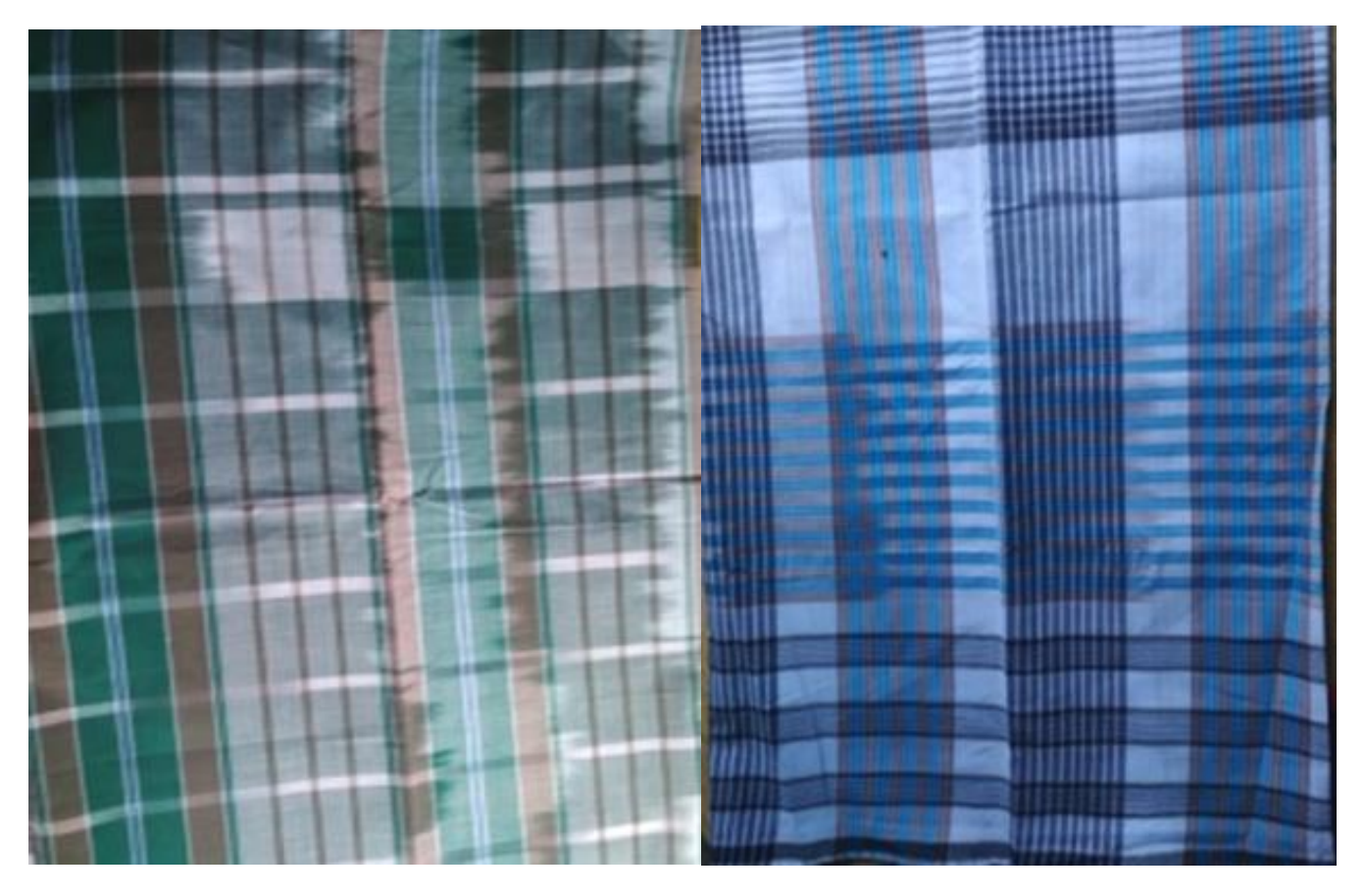
43. Home Furnishings and Towels

Lungi is a casual wear for men. It is woven with all colours. Pit looms are used for weaving lungi in Cuddalore and Viluppuram districts. Walking temple of 12 to 16 nos. are used on each side is adopted to keep the selvedge in tight condition and to maintain uniform width. Usually, picksper inch is more than ends per Inch. This lungi is locally called as Katari (tie&dye) Lungi. Warp tie & dye technique is used.