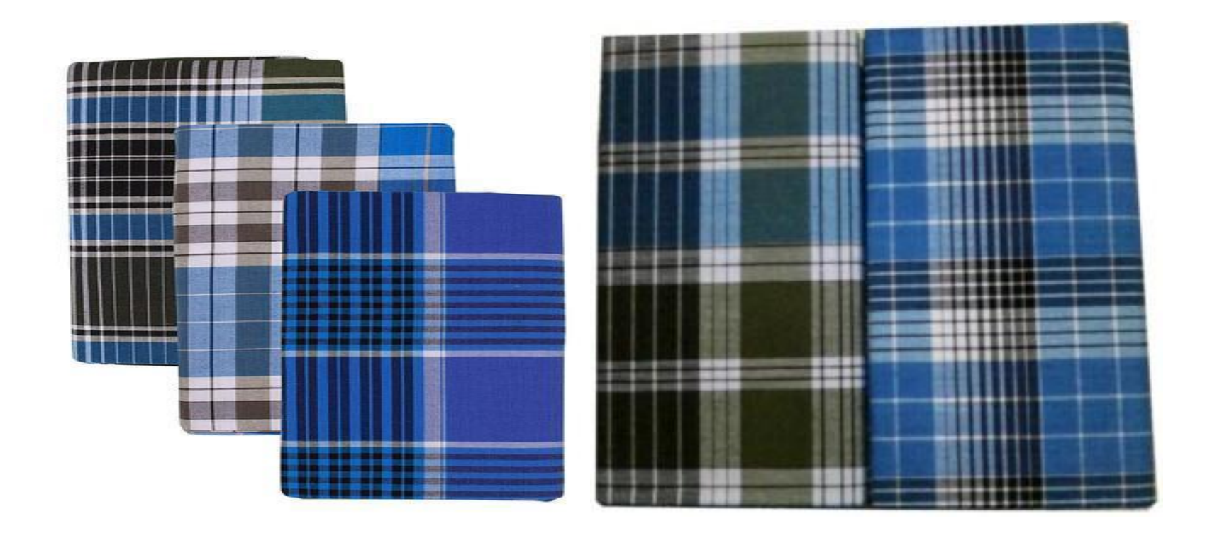
18. & 19.Pillaiyar Towel

Cotton lungies produced in Gudiyattam are very traditional handloom product and unique in character. Walking temple of 12 to 16 nos each side is adopted to keep the selvedge in tight condition and maintain uniform width. Usually, picks per inch is more than the ends per inch i.e. 84 ends X 96 picks for 60s warp X 40s weft which is the most common product in lungies. Cotton lungies produced in this region are made with crisp stripes and colorful checks for elegant look. These lungies are cool and comfortable for daily use.