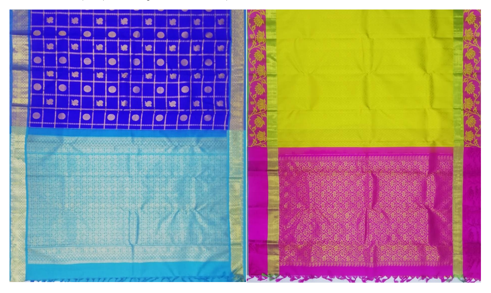
13. Ponnai Tie & Dye Cotton Saree

Arni silk Sarees are woven on looms fitted with Dobby/Jacquard using mulberry silk threads in both warp and weft. These Sarees are light weight silk Sarees with traditional contemporary floral and geometrical motifs in pallu and double side borders.