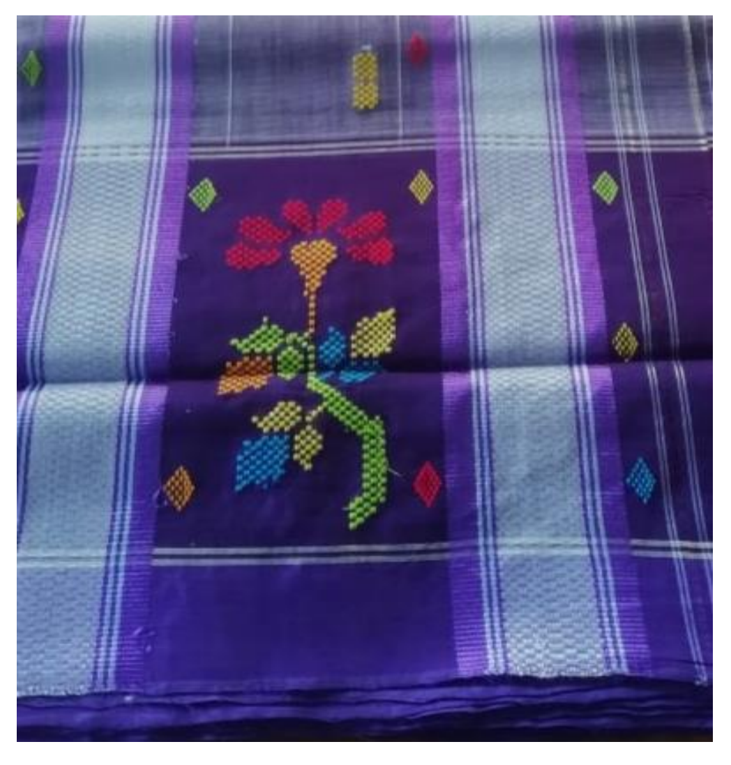
40. Koorainadu Saree

Chedi butta Sareesare woven at Veeravanallur of Tirunelveli District. These Sarees are woven in art silk warp and 60s cotton weft. The buttas are being woven by hand only without adopting jacquard/dobby/Adai. Since plant motifs are only used for buttas, these Sarees are called Chedi (plant) butta Sarees.