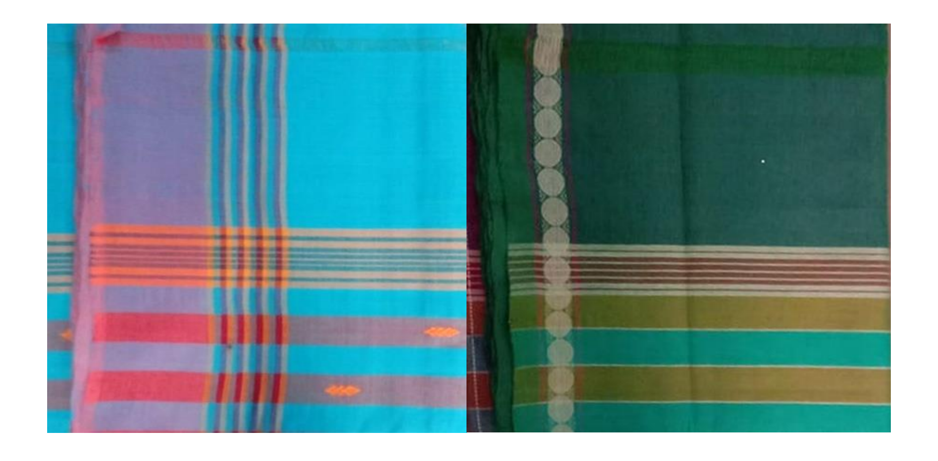
34. <u>Siruvanthadu Silk Saree</u>

It is a pure cotton Saree having simple designs on border, body and pallu of the Saree. Stripe and checked patterns are also woven on the body of the Saree. Small buttas are woven inside of the check box. Variety of coloursare used for weaving of AruppukottaiSaree. The warp and weft count used are 60s.