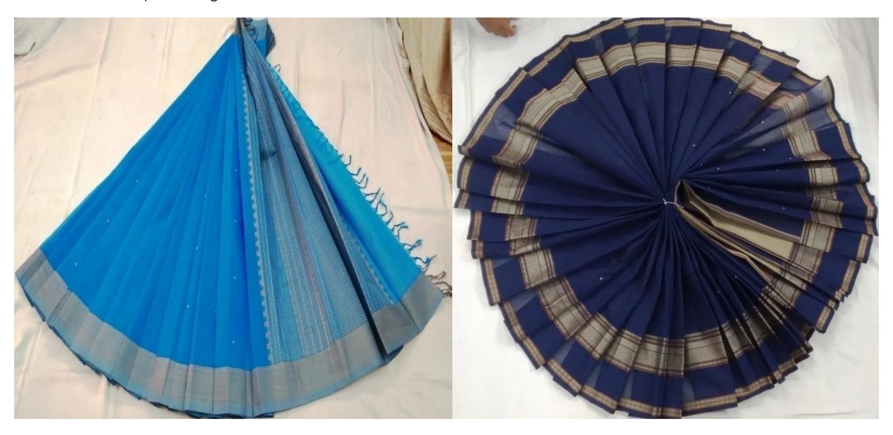
32. Kora Cotton Saree

These exclusive Sarees are woven on frame loom using cotton warp and weft. Two 120 hooks jacquards are used, one is to produce border and another is for pallu. In pallu, various floral and geometric designs are woven up to 27". These Sarees are finer count Sarees with border and pallu designs.